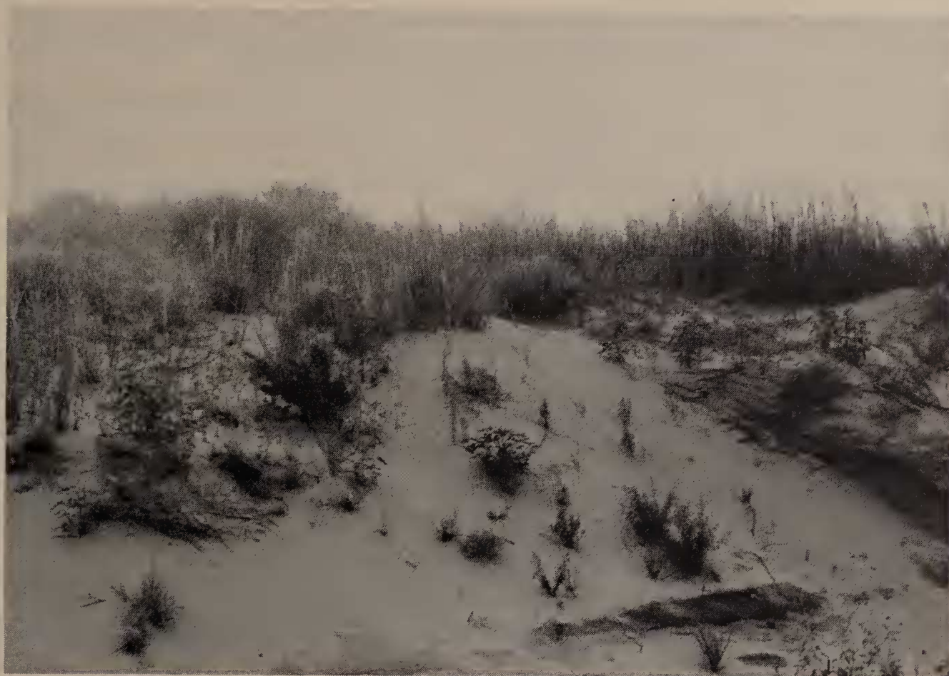
FIG. 3.—Sand dune in process of stabilization, western Bailey County.

and average daily minima 20.0^{\circ} and 63.7^{\circ} , respectively). The average annual daily minimum and maximum temperatures were 41.3^{\circ} and 72.5^{\circ} .